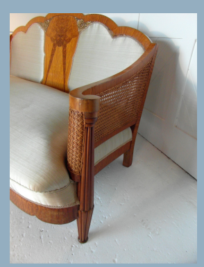
See latest updates for details

Art Deco salon suite Attributed to Waring & Gillow.